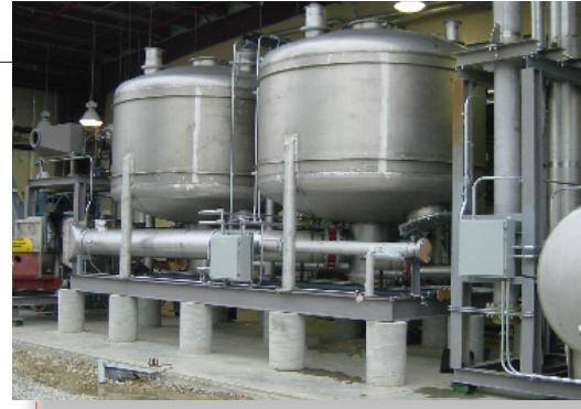
Company History and Background