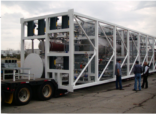
Single Source for System Components