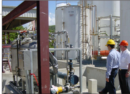
Biodiesel Plant Services for Operating Plants