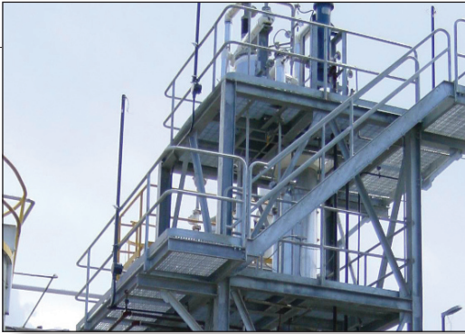
Biodiesel Plant Process Systems